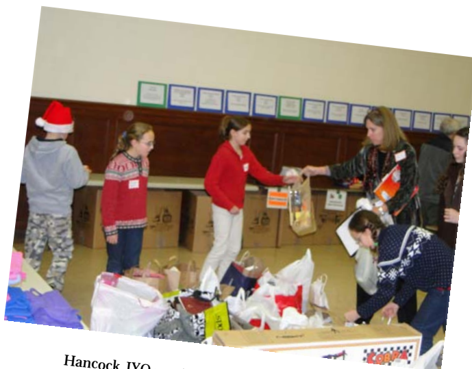
Hancock JYO participates in sorting day for City Mission Society of Boston at First Church Winchester.

Families, singers of all ages, come to the caroling party and pizza supper for fellowship and holiday joy! Meet at Hancock at 3:30pm to then depart for caroling. We'll return to Hancock for refreshments and pizza in the dining hall and finish in time for Worship @ the Well.